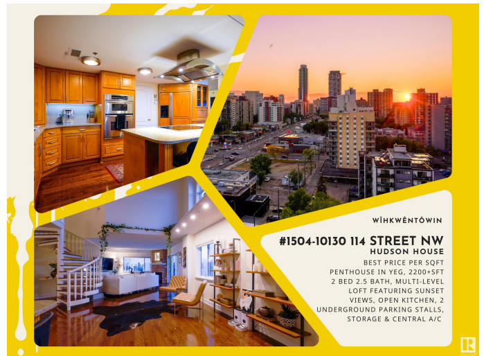
#1504 10130 114 STREET HUDSON HOUSE OLIVER, EDMONTON